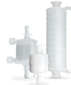
Capsule Junior, Mini, Mid-Size, Full-Size