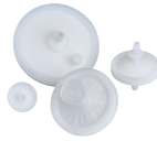
Disc Capsule 4 mm – 90 mm 2.7" x 1.7"