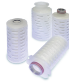
Cartridge Junior, Mid-Size, Full-Size